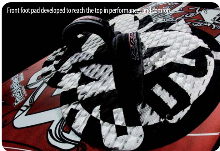
Front foot pad developed to reach the top in performances and comfort