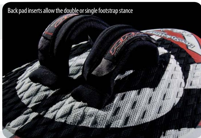
Back pad inserts allow the double or single footstrap stance