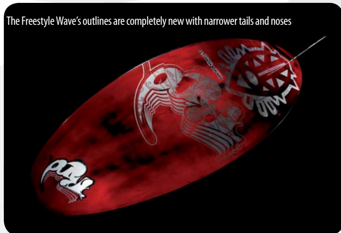
The Freestyle Wave's outlines are completely new with narrower tails and noses