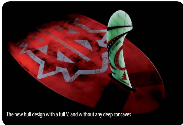
The new hull design with a full V, and without any deep concaves