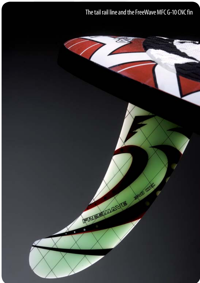
The tail rail line and the FreeWave MFC G-10 CNC fin